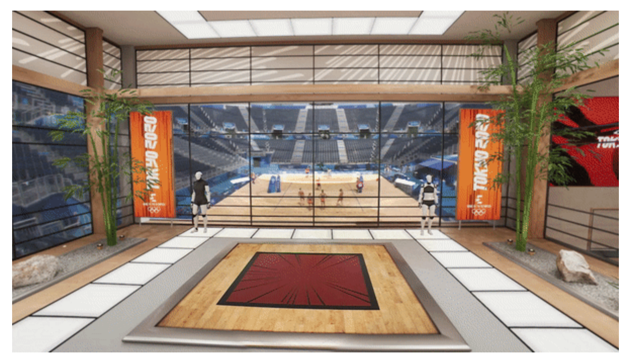
Figure 2 - Studio Backdrop using an Immersive Camera as used for Tokyo 2020