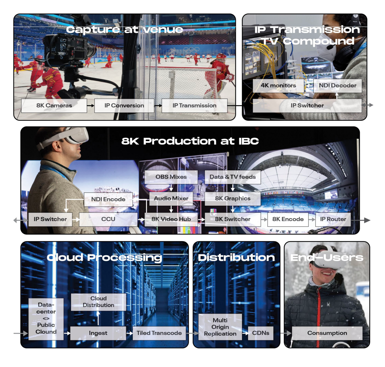
Figure 1 - Camera to Headset

As noted above, we used five VR180 cameras for the production, with a director producing a single VR180 feed by switching between these. The cameras were placed as close as allowed to the action, in such a way that collectively, they could cover all of it. For example: